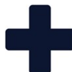
Address: Prince Mohammad bin Nasser Road, Jizan